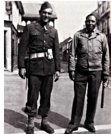
US forces in Moreton in 1944 (See May's events)

Meetings begin at 7.30 p.m. at the Union Inn, 10 Ford Street, Moretonhampstead TQ13 8LN.