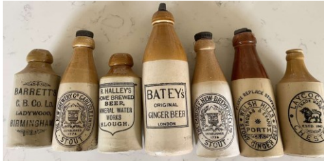
Ginger beer stone bottles