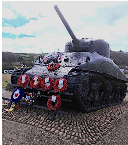
Exercise Tiger Memorial Slapton Sands